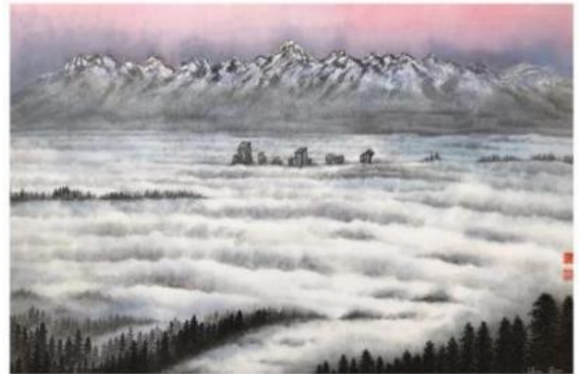
Good Morning Seattle by Ann Gan