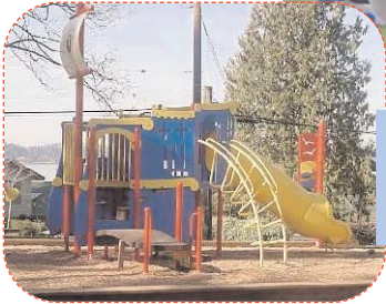
Roanoke Park Playground Equipment