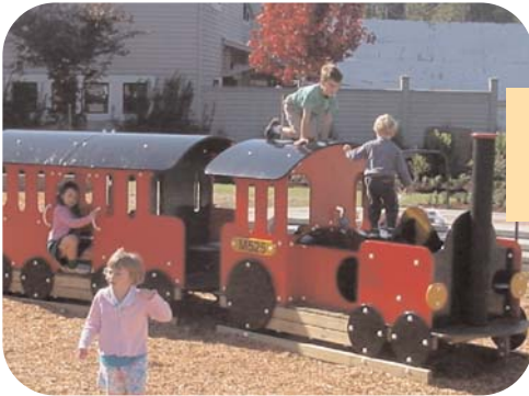
Mercerdale Park Children's Play Area

Public Art • Land • Trees • Picnic Tables • Children's Play Equipment • Benches • Historical Signage • Exercise Equipment • Pool Tables • Organ • Flowers • Scholarships • Portable Stages • Volunteer Time in Programs • Toys and Games • Mostly Music in the Park Summer Concert Series • Summer Celebration! Festival...and more.