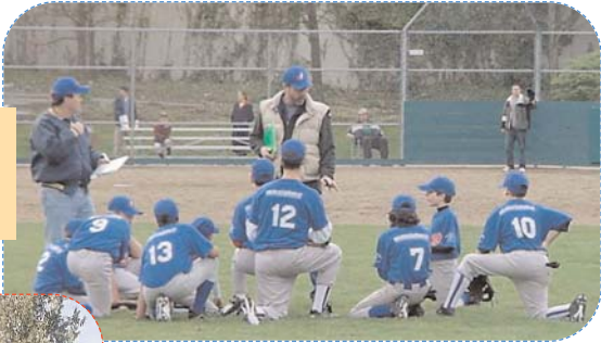
Park on the Lid Ballfield